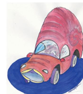
Steve Layton's "Snailpace," a car perfectly suited for Irvine