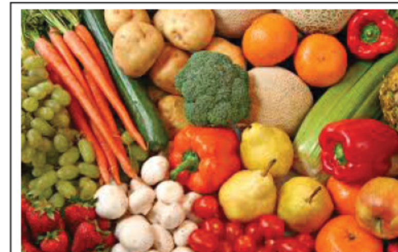
When you actually look forward to a meal of fresh vegetables, which may be steamed, and fruits, you will then know that you have achieved a sustainable healthful diet.

My conclusion now is that not only is soda pop and its many incarnations, including so-called "diet" drinks, bad for you; it's the fact that they taste good to so many people that's a worse problem. And they taste good, really, only to people who have a bad, sugar-laden diet. The result for them is that healthful, wholesome food doesn't taste so good. The need for sweet (and salt), promoted by the so-called food industry, has become so ubiquitous an addiction, that it's difficult to find any packaged food product that doesn't have lots of sugar and salt added. And that's not just in cookies and cakes, but in soups and salad dressings. It's hard to find a breakfast cereal that's not loaded with sugar. (My favorite: Ezekiel 4:9 Organic Sprouted Grain Crunchy Cereal)