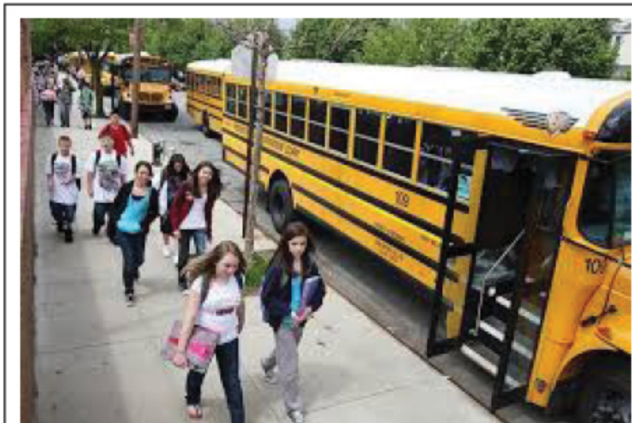
Reinstituting a comprehensive school bus system will go a long way towards alleviating morning traffic jams and safety hazards around Irvine schools.