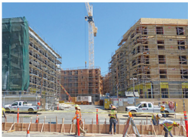
These south Irvine apartments are among thousands of units built in 2017-2018.