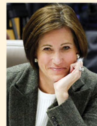
Rep. Mimi Walters (45th Congressional District). Behind the smile, a deplorable record on climate change.

Next, Walters should also step up and co-sponsor a first-ever all-Republican House Resolution introduced on March 15th calling for action on climate change.