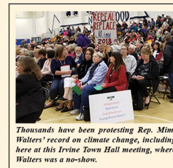
Thousands have been protesting Rep. Mimi Walters' record on climate change, including here at this Irvine Town Hall meeting, where Walters was a no-show.

Climate change is the most serious environmental problem humankind has ever faced. It's deeply troubling that some of our representatives can be so out-of-step with their constituents on climate change. Are they genuinely clueless about what their constituents think, or do they just not care? Either is unacceptable.