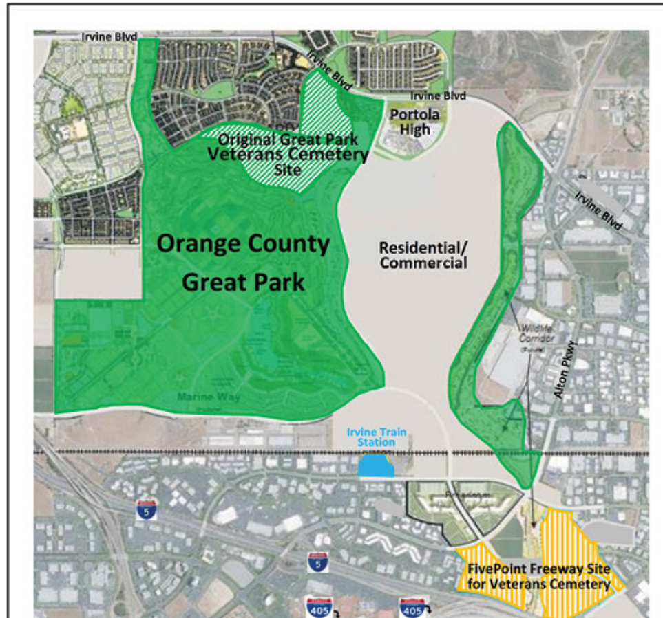
The original Veterans Cemetery, which has been approved by the City, State, and Federal governments, is pictured here in diagonally-hatched, light-green, as part of the Great Park. The FivePoint land-swap property is pictured here (lower right corner) as the vertically-hatched, orange site near the convergence of the I-5 and I-405 freeways, known as the El Toro "Y."