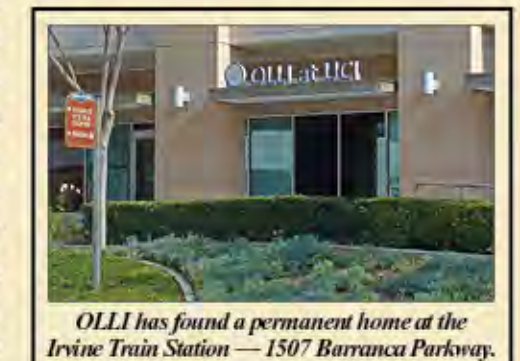
OLLI has found a permanent home at the Irvine Train Station — 1507 Barranca Parkway.

Simply put, OLLI's goal is to offer the community experiences and lectures that promote intellectual growth for senior citizens. In a continuing collaboration with UCI, OLLI provides a very wide range of educational opportunities in a variety of fields. Quality speakers volunteer their expertise for classes and lectures in Arts and Humanities, Science, Technology, Engineering & Mathematics, Social Sciences, as well as for special events and trips to all sorts of venues in Southern California.