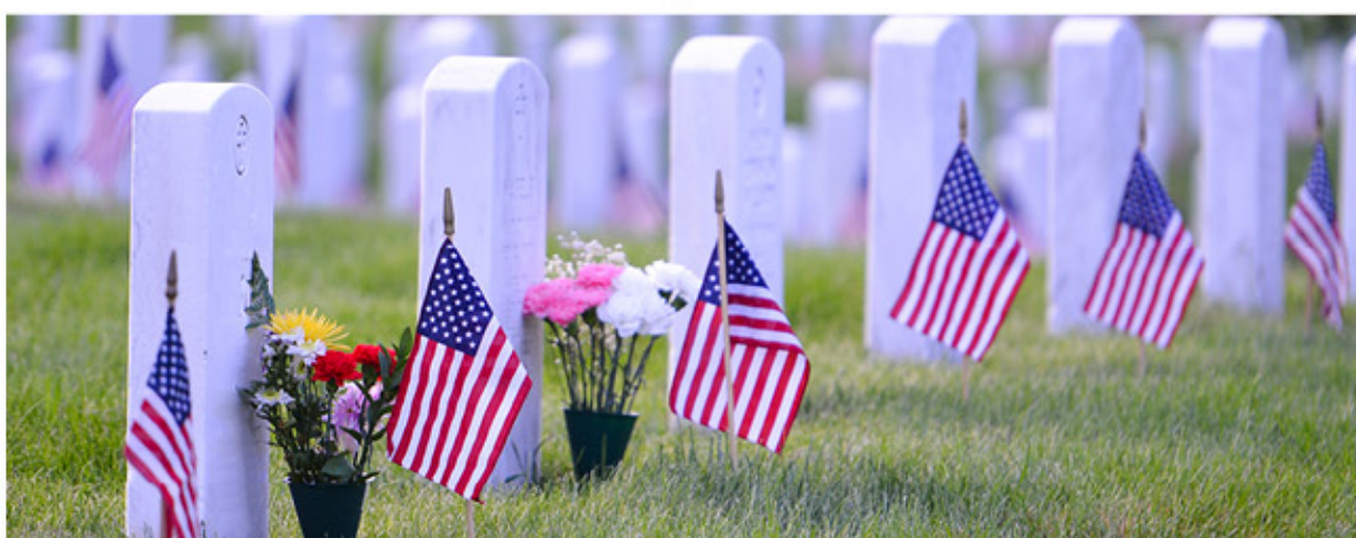
With new State funding, the Southern California Veterans Memorial Park and Cemetery at the Great Park could soon be built and operational.

Initially approved by the Irvine City Council and State Legislature in 2014, the planned Veterans Cemetery in the Great Park is now on the federally-approved "Priority List" for funding and construction. With State and local funding, the officially designated Southern California Veterans Memorial Park and Cemetery — on a 125-acre site within the Great Park — could be built and operational by Veterans Day, 2019.