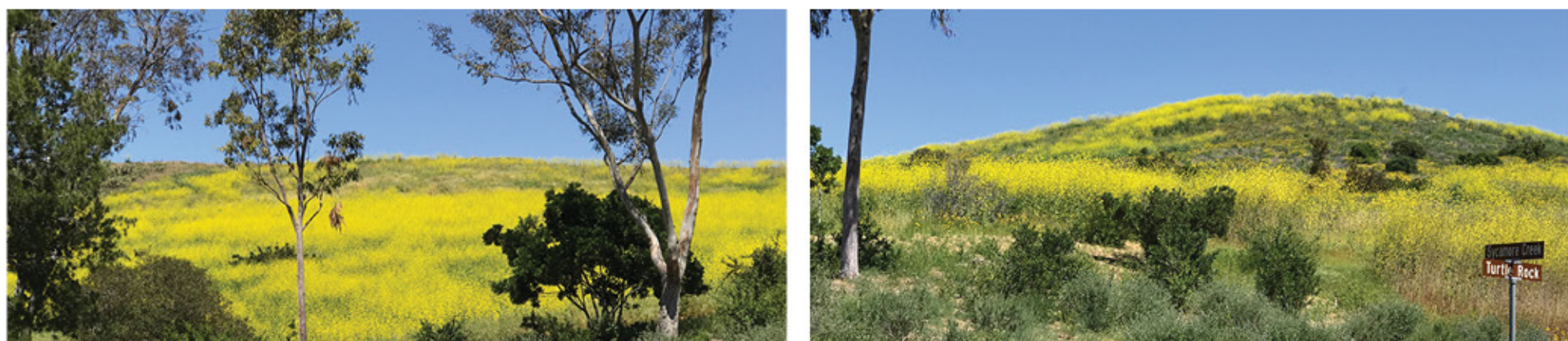
Turtle Rock open space (corner of Turtle Rock Dr. & Sycamore Creek), Spring 2017.