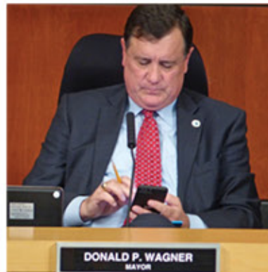
Texting, not listening.

As for Councilmember Melissa Fox, at a critical point in the meeting, she was obviously so mixed up and distracted by all the texting that she first voted for the Lalloway $40 million Great Park Veterans Cemetery proposal, which passed 3-to-2 (Wagner and Shea voted NO) but then, moments later, she asked to “reconsider” her vote. Apparently, she was receiving text messages with instructions to present a new motion that included direction to City staff to also explore a “second track” for the Veterans Cemetery — a complicated “land-swap” scheme with developer FivePoint Communities. The “land-swap” scheme, pushed by Councilmember Christina Shea and Mayor Donald Wagner, would move the Veterans