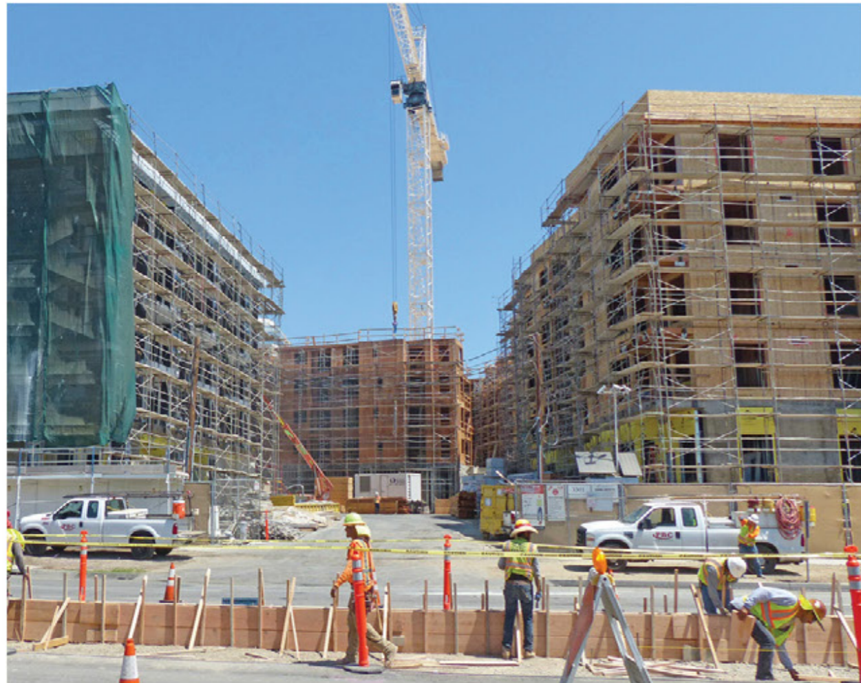
These apartments in south Irvine are among the thousands of units being built in 2017 and 2018.