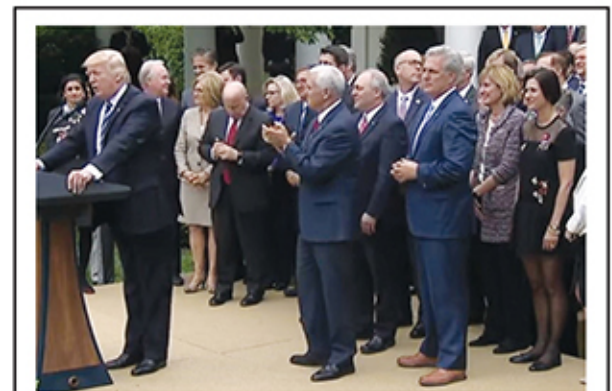
Rep. Mimi Walters (standing, far-right), is pictured here in a May 4th Rose Garden ceremony. Walters championed the House healthcare bill, which President Trump lauded. Weeks later, learning of its devastating effects, he described the measure as a "mean" bill.