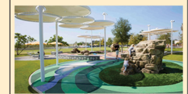
These Great Park features, and others, have been built with investments from the special Great Park Development Fund, known as Fund 180.

as a result of the shrewd “redevelopment tax-increment” funding we negotiated with the State more than 10 years ago.