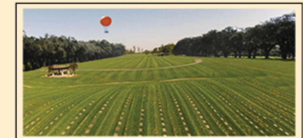
The Great Park Veterans Cemetery, Phase 1, can be built in just two years with $38 million in funding from the Great Park Development Fund.

Now, flash forward to today: According to the State, the CalVet-approved Veterans Cemetery in the Great Park will cost an