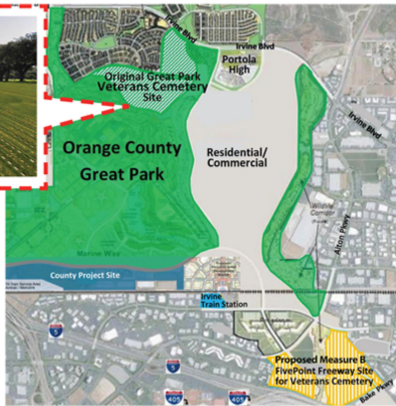
Artist depiction of Great Park Veterans Cemetery

from one end of Irvine to the other since the June 5th election: “Listen to the people, not developer FivePoint Communities.”